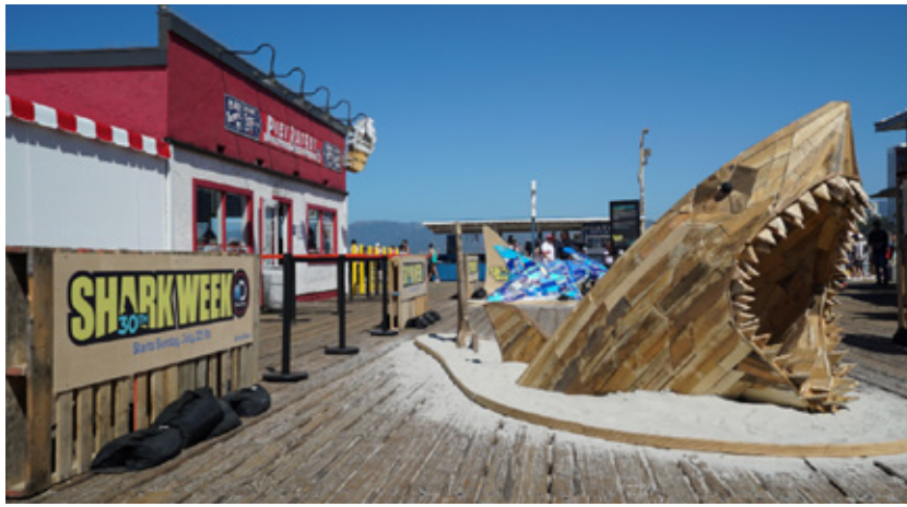
Discovery Shark Week