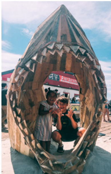
Discovery Shark Week