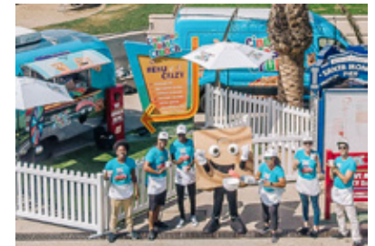
Cinnamon Toast Crunch