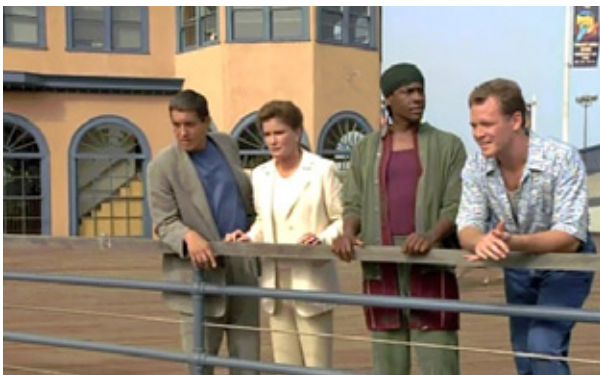
Star Trek Voyager