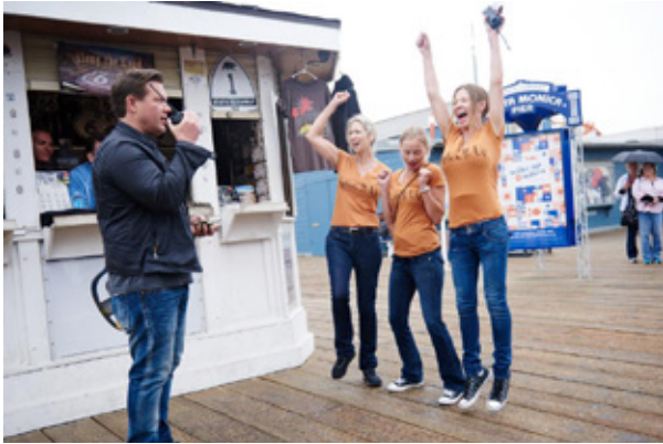
Great Foodtruck Race